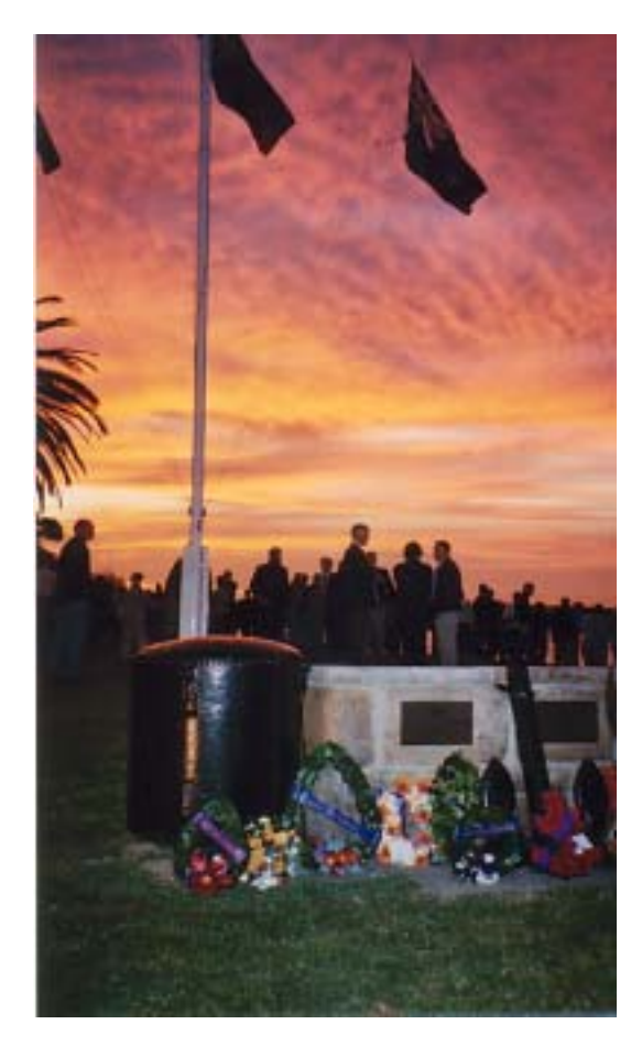
Sunrise at Chowder Bay.